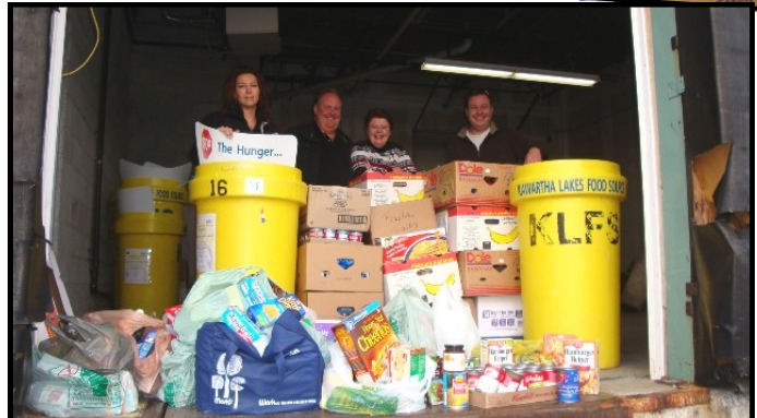
Left to right: CUPE 855 & 855-1, Taoist Tai Society, Grignon-Payne family, Lindsay Transit and Kawartha Lakes Real Estate Association.